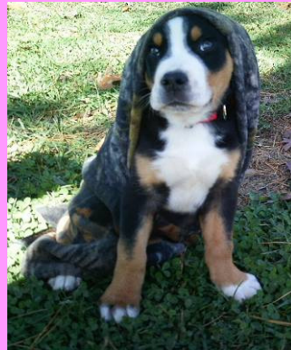
Fiji and Ember Stanhoff